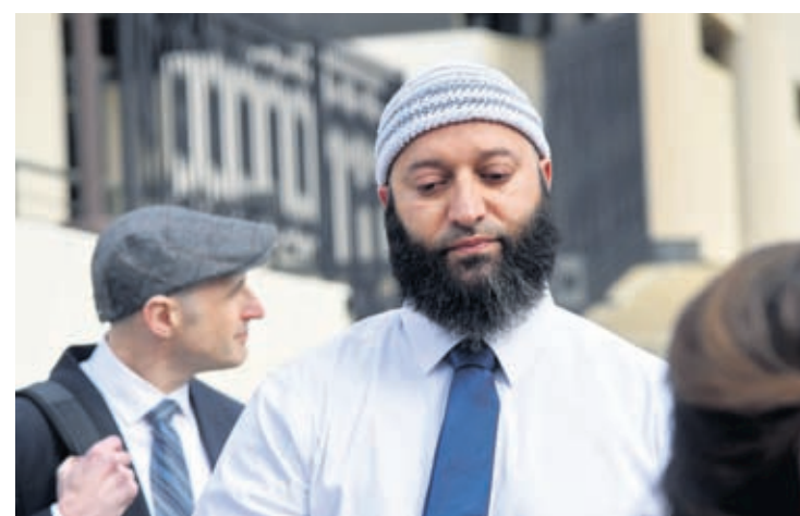
Adnan Syed gets emotional as he speaks to reporters outside the Robert C. Murphy Courts of Appeal building after a hearing, Thursday, Feb. 2, 2023, in Annapolis, Md.